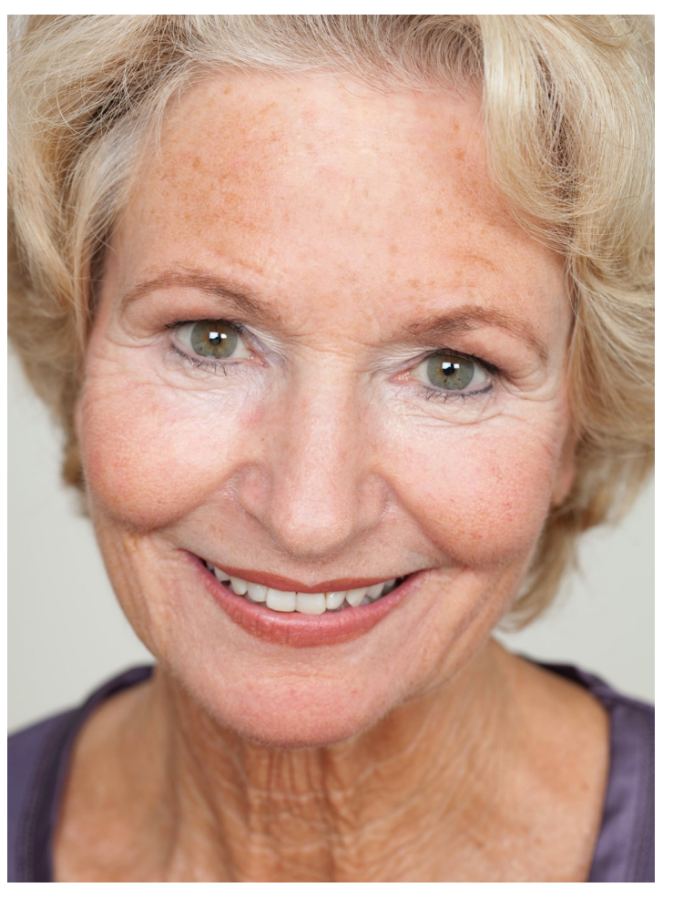
How does Resveratrol work? As our bodies combat daily stress and age, mitochondrial function can become slowly compromised leading to impairment in many bodily functions including blood pressure, attention and concentration, skin health, bone health, eye health and joint health.

With more than 17,000 published studies and over 270 human clinical trials (Pubmed, May 2023), Resveratrol is considered one of the most well-investigated compounds applied in food and beverages, dietary supplements and cosmetics.